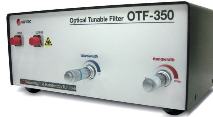
SANTEC OPT 350 MANUAL WAVELENGTH TUNABLE OPTICAL FILTER