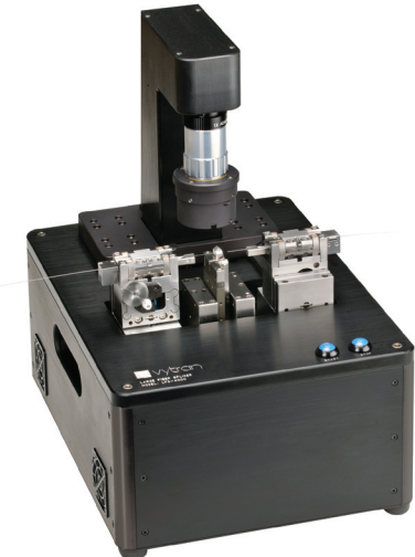
VYTRAN LFS 4000 LARGE DIAMETER FIBER SPLICER