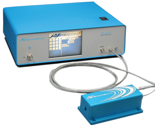
NOVAWAVE TECHNOLOGIES IRIS 1000 DFG-BASED MID-INFRARED LASER SYSTEM