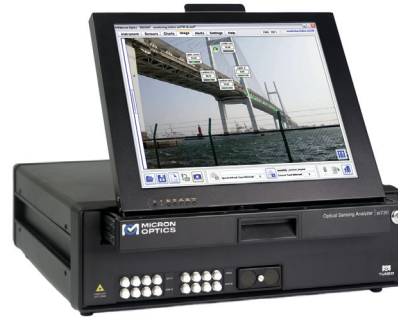
MICRON OPTICS SI730 OPTICAL SENSING INTERROGATOR

We provide competitive pricing, acceptable lead times and speedy replies to enquiries.