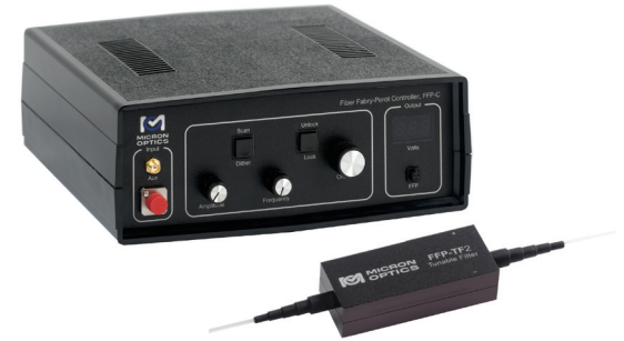
MICRON OPTICS FIBER FABRY-PEROT TUNABLE FILTER AND CONTROLLER