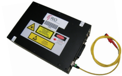
REDFERN INTEGRATED OPTICS RIO GRANDE HIGH POWER SINGLE FREQUENCY LASER MODULE